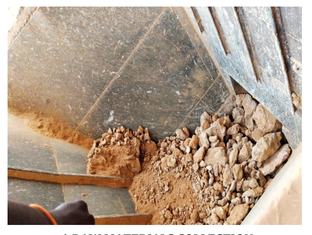
1.RAW MATERIALS COLLECTION