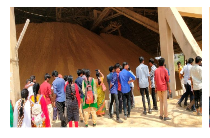
3.RAW MATERIALS STORAGE