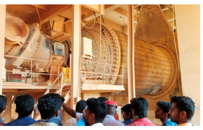
4.RAW MATERIALS FINE GRINDING