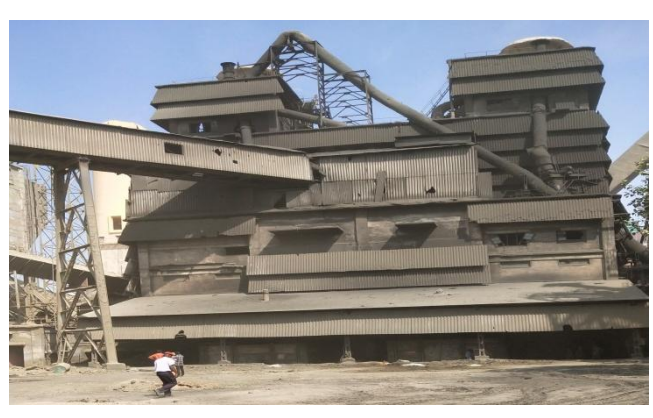
6. COOLING UNIT